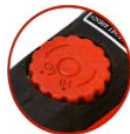
New Air Regulator