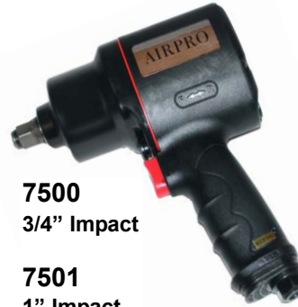
7500 3/4" Impact