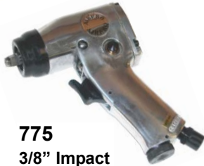
775 3/8" Impact