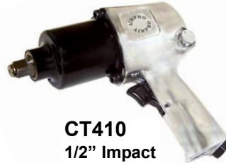
CT410 1/2" Impact