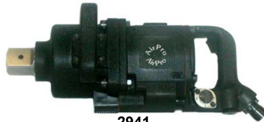
2941 1-1/2" Impact