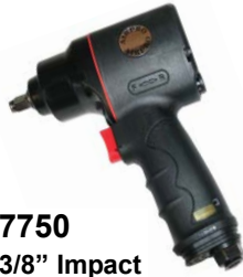
7750 3/8" Impact