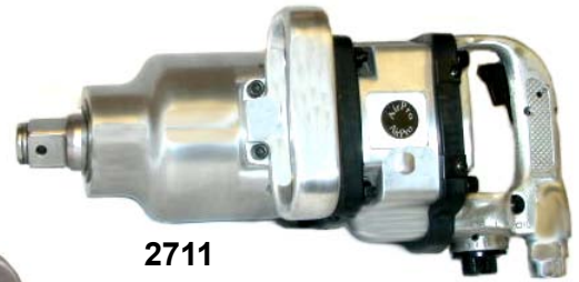
2711 1" Impact