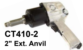
CT410-2 2" Ext. Anvil