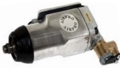
401 3/8" Butterfly Impact