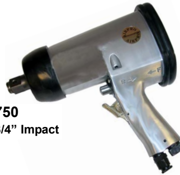
750 3/4" Impact