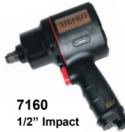
7160 1/2" Impact