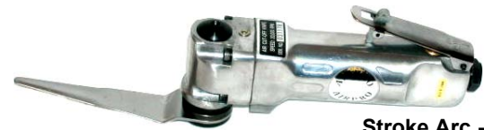
517 Window Cut-off Tool