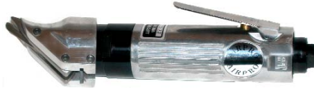
710-S Straight Shear