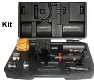
6902K Utility In-Line Driver Kit