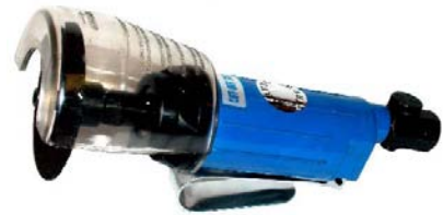
510 3" Cut-Off Tool

Ideal for body shops, muffler and exhaust work, plastic, steel plate, fibreglass and siding installation.