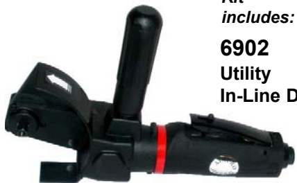
Kit includes: 6902 Utility In-Line Driver