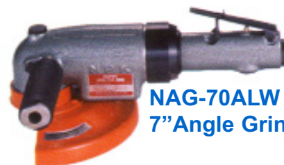
NAG-70ALW 7" Angle Grinder