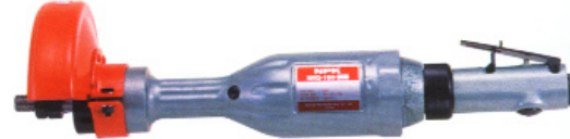
NHG-150LW Straight Grinder