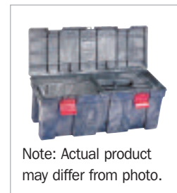
Note: Actual product may differ from photo.

Optional Storage Box Storage box for hydraulic cylinder and pump sets. Rugged industrial strength material, strong as steel, never needs painting, won't rust, dent or chip. Weatherproof lid is self sealing and lockable. Molded-in handles, water-tight, one piece bottom and side construction. Strong enough to stand on. No. 350722 – 35"L x 14"H x 13½"W, storage box.