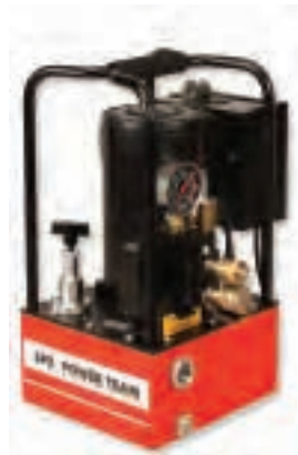
PE30TWP Torque Wrench Applications See page 161