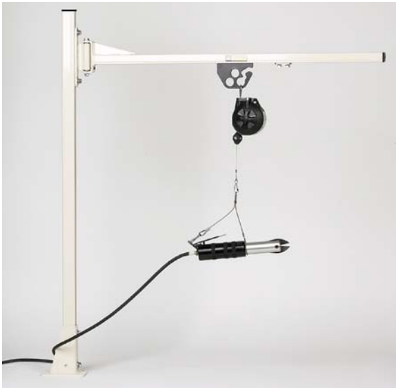
Optional tool balancer and harness shown in picture sold separate

Simonds line of ergonomic support systems is for use with any remote power pack or jaw set combination. Helping to relieve the strain and fatigue of hefting a power pack all day, these systems will help improve productivity while eliminating injuries through ergonomic design. The optional tool balancer and tool harness is made for holding the power pack and jaw set in a horizontal position.