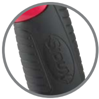
Ergonomic, handle with soft textured grip