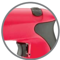
Teasing throttle, conveniently located reverse