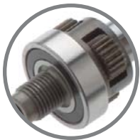
3 planet gear system for increased life and load capacity