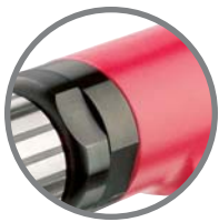
Light weight aluminum housing