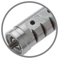
Available in 1 HP and .6HP motor