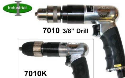
7010 3/8" Drill