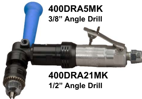
400DRA5MK 3/8" Angle Drill