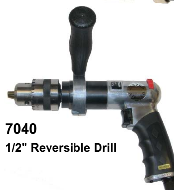
7040 1/2" Reversible Drill