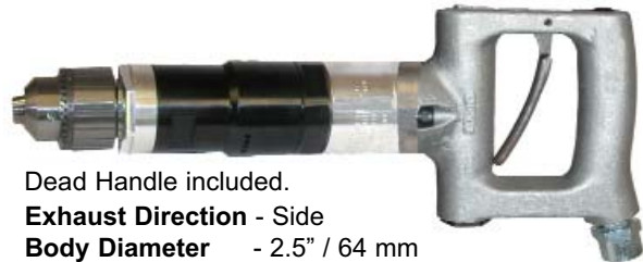
500D2M & 507D2M 3/4" 'D' Handle Drills

Dead Handle included. Exhaust Direction - Side Body Diameter - 2.5" / 64 mm