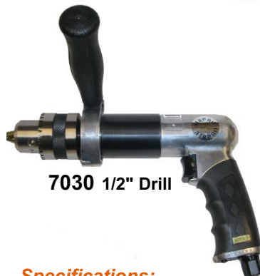
7030 1/2" Drill