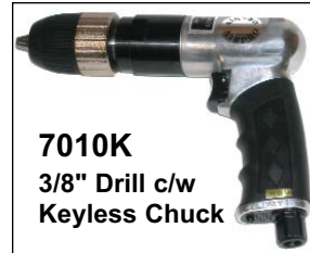
7010K 3/8" Drill c/w Keyless Chuck