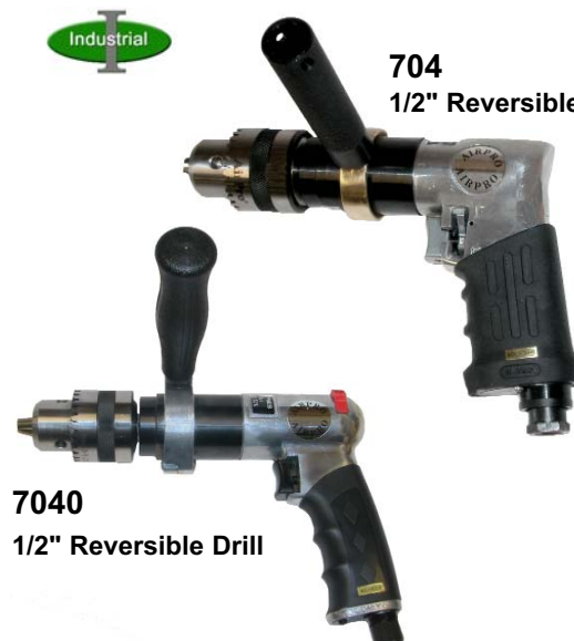
704 1/2" Reversible Drill