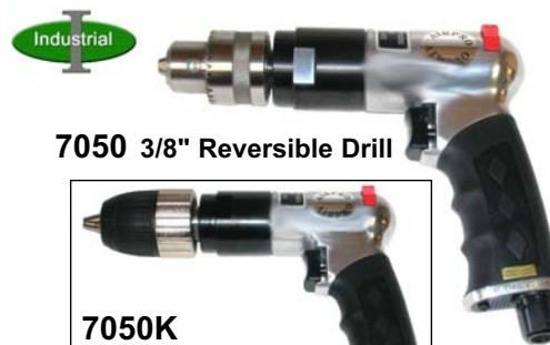
7050 3/8" Reversible Drill