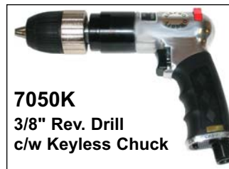
7050K 3/8" Rev. Drill c/w Keyless Chuck