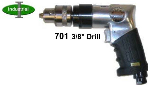
701 3/8" Drill