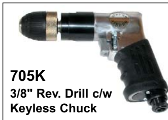
705K 3/8" Rev. Drill c/w Keyless Chuck