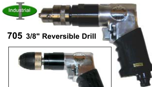
705 3/8" Reversible Drill