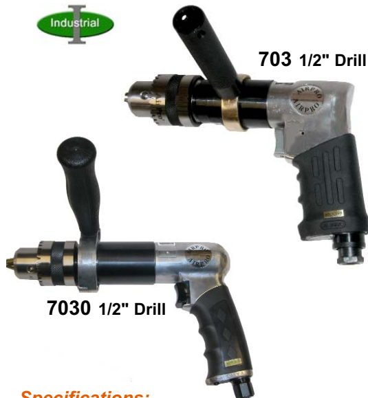
703 1/2" Drill