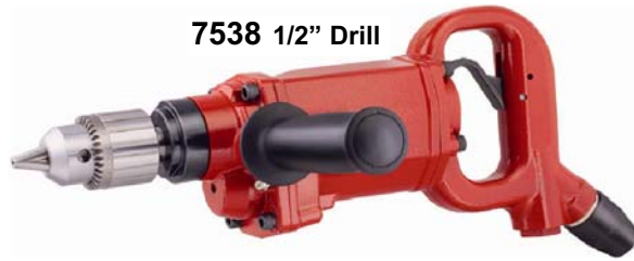
7538 1/2" Drill