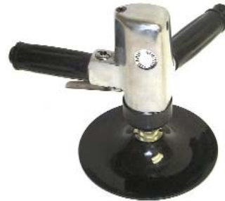
821 7" Vertical Sander

Extra heavy gearing for heavy duty operation. Adjustable speed control allows delicate feather-edging to full speed Sanding.