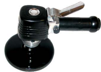
420 Dual Action Sander

Ball bearing construction, balanced counterweights and built-in speed regulator makes this sander ideal for metal preparation.