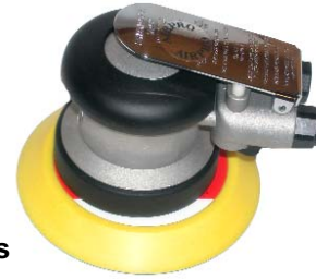
6050N-5 & 6050N-6 5" & 6" Random Orbital Sanders