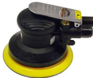
6309N-5 & 6309N-6 5" & 6" Random Orbital Sanders