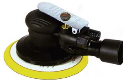
6309V-5 & 6309V-6 5" & 6" Random Orbital Sanders - c/w Central Vacuum Pick-up