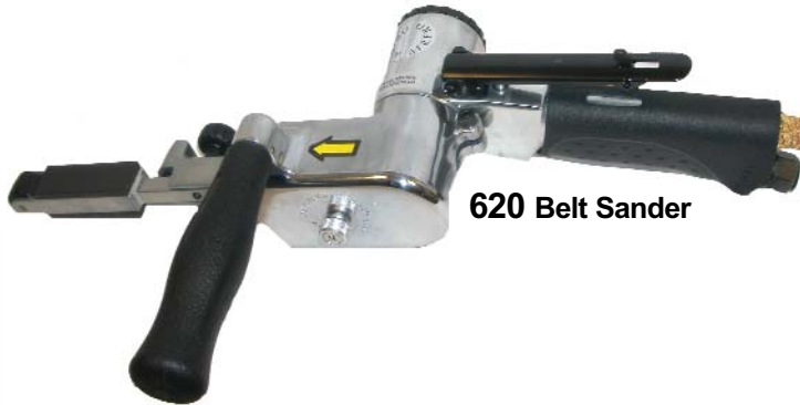
620 Belt Sander