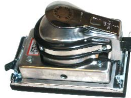
416 Jitterbug Sander

This heavy duty sander is ideal for body and paint shops. Constant orbital stroke provides a swirl-free finish. Powerful, fully enclosed motor. Balanced for vibration free performance. Ideal for wet or dry sanding.