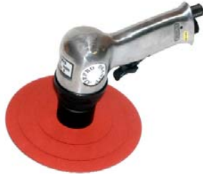
402 5" High Speed Sander

Designed for finishing flat or contoured surfaces. Ideal for touch-up, feather-edging.